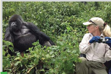
Tracking the Mountain Gorillas