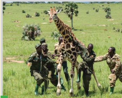
Translocation of Giraffes from Murchison Falls National Park

The Ministry and all its agencies, reassures Ugandans to stewarding this growth and as we celebrate the achievements of liberation, we urge you to develop a culture of patriotism, visit and enjoy the attractions in your country, conserve and protect the environment, promote peace and stability, invest and develop the attractions and make Uganda the preferred tourist destination in the world.