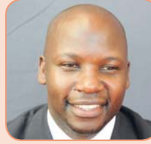
HON. GODFREY KIWANDA SSUUBI State Minister for Tourism, Wildlife and Antiquities