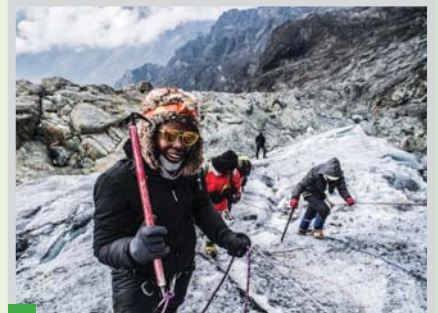
Rwenzori Snow capped Mountain

Ministry of Tourism, Wildlife and Antiquities