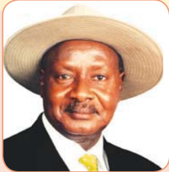
H.E. Yoweri Kaguta Museveni President of the Republic of Uganda