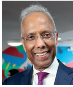
LUTFUR RAHMAN Mayor of Tower Hamlets