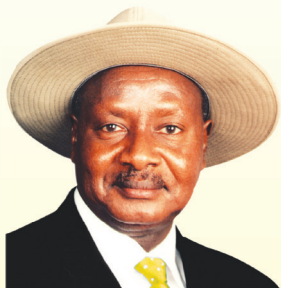
H. E. Gen. Y. K. Museveni, The President of the Republic of Uganda