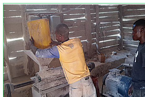
Maize mill in Butunduzi Tweyimuke town council in Kyejono district procured under LRDP