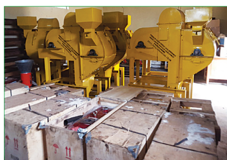
Coffee Hullers and their engines in the stores at the district awaiting delivery to the beneficiaries. (Kasese District)