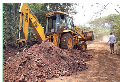
Works on the 8kms Nyanja – Etegera-Kasazi Road in Bugogo subcounty Kyejono district being done with LRDP funding