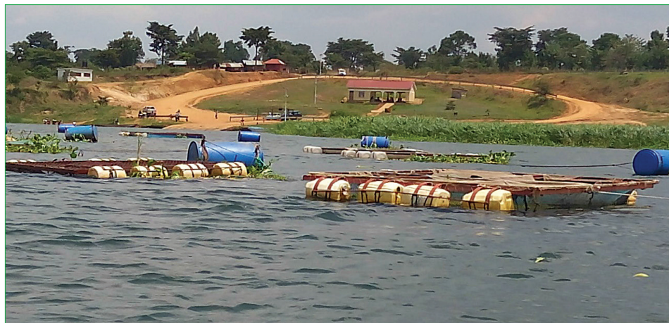
Fish cages on River Nile belonging to Centre for Educating Adult and Child Organization Farmers Association (CEACO); Kayunga District