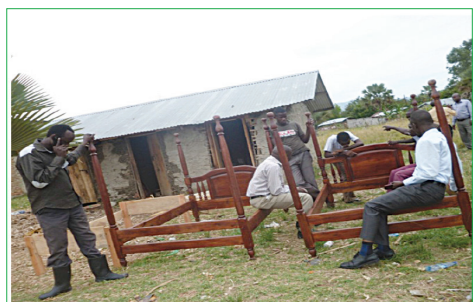
Beds ready for sale that were produced by Makondo Youth Group, Rwebisengo, Ntoroko District that has been supported with carpentry tools and working capital under LRDP