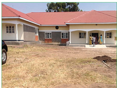
Kabarole Youth Centre established with support under the LRDP