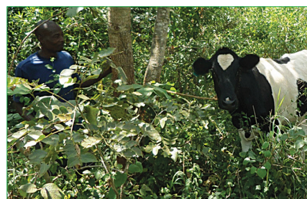
Some of the heifers distributed to 120 beneficiaries in Luwero District

For more information reach us at Office of the Prime Minister, 5th Floor Plot 9-11 Apollo Kaggwa Road. P. O. Box 341 Kampala Uganda Website: www.opm.go.ug