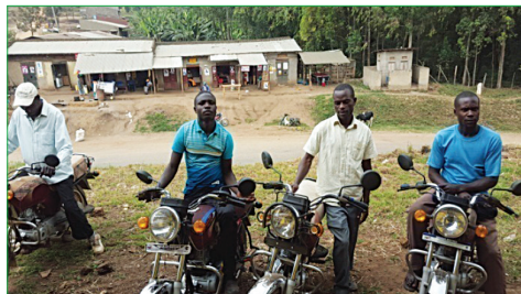
Kibito Boda Boda Association; Kabarole District Supported with 20 motorcycles to enhance their incomes. Through their own savings, they have been able to acquire 10 more.