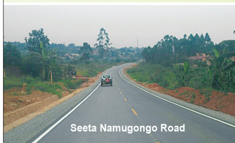
Seeta Namugongo Road

We have constructed roads and drainage on Seeta- Namugongo Road, Nsambya Road, Makindye Road and Rehabilitated Kampala - Jinja road, Nakawa Road. We have also done street lighting on Nakawa Road. Our commitment to quality, integrity, ethical conduct has led to our rapid growth in the construction industry. We are strongly committed to providing reliable and high quality products i.e. the right product in the right time and at the right cost.