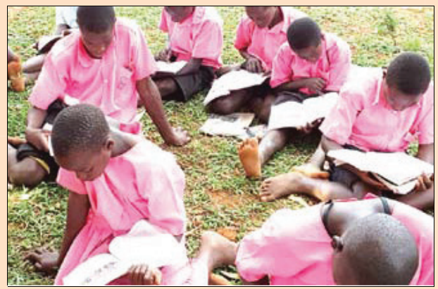
School Pupils utilize reading materials in Lusoga

Under the Uganda Teacher and School Effectiveness Project, the sector planned to procure and distribute a total of 6,500,000 copies of textbooks non-textbooks and teacher reference materials procured and supplied to schools. During the period of review, a total of 6,015,099 copies of instructional materials; were supplied to 12.198 primary schools in 112 districts. The materials included:-a total of 4,720,041 copies of textbooks, non-textbooks, 753,113 copies of P1 primers 541, 293 P2 primers to 2,656 primary schools benefiting under Early Grade Reading.