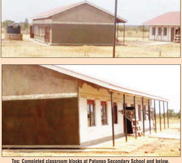
Top: Completed classroom blocks at Patongo Secondary School and below completed classrooms at Awara College Itori

In addition, under presidential pledges, the sub sector planned to construct five new schools. Civil works were completed in Kamusenene S.S. and Mugungulu Seed Secondary School in Mubende, Obalanga Seed S.S in Amuria, and civil works was on-going in Masese Secondary School in Jinja and Karangura secondary school in Kabarole.