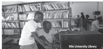
Nile University Library

FOR QUALITY EDUCATION, ACADEMIC EXCELLENCE, PROFESSIONAL PRACTICE AND INTEGRAL GROWTH AND DEVELOPMENT