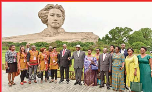
On June 27, 2019, President Yoweri Kaguta Museveni visited the monument of Chairman Mao Zedong in his youth, in Hunan Province, China.