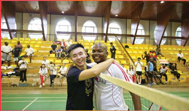
On September 14 and 15, 2019, Uganda-China Friendship Badminton Tournament was held in Kampala. Chinese and Ugandan badminton lovers further deepened friendship through the tournament.