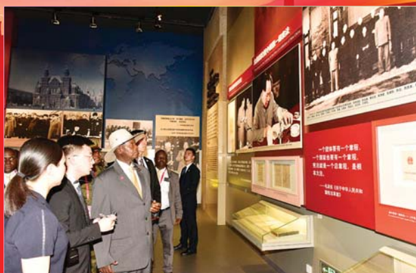
On June 27, 2019, President Yoweri Kaguta Museveni took a "revolutionary pilgrimage" to the birthplace of Chairman Mao Zedong in Hunan Province, China.