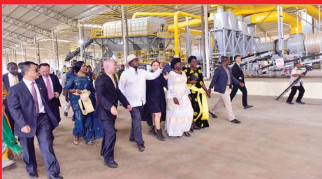
On October 23, 2018, President Yoweri Kaguta Museveni commissioned Sukulu Phosphate Comprehensive Industrial Project implemented by the Guangzhou Dongsong Energy Group Uganda Limited in Tororo District.