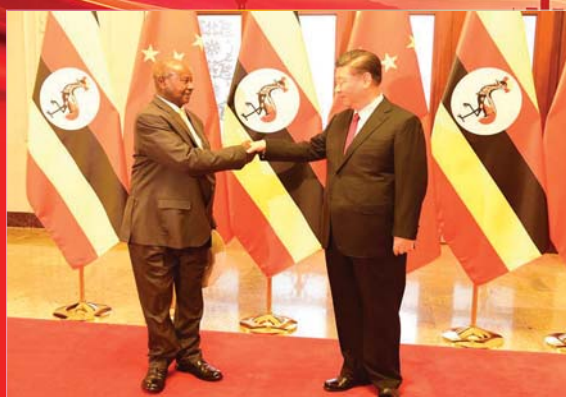
President Xi Jinping and President Yoweri Kaguta Museveni held talks on 25 June, 2019, and agreed to elevate China-Uganda relations to a Comprehensive Cooperative Partnership.

THE 70TH ANNIVERSARY OF THE FOUNDING OF THE PEOPLE'S REPUBLIC OF CHINA 1949-2019