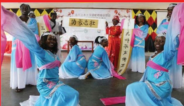
On December 20, 2018, the trainees of the Ugandan Chinese Language Teachers Training Programme gave a performance during the graduation ceremony.