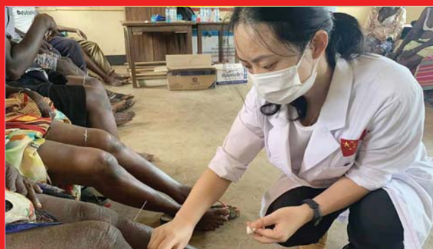
A doctor of China-aid Medical Team provided free acupuncture treatment in the rural area of Uganda.