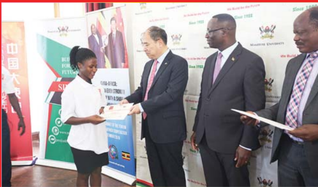
On September 5, 2019, 30 students of Makerere University were awarded the Chinese Ambassador's Scholarship of 2019.