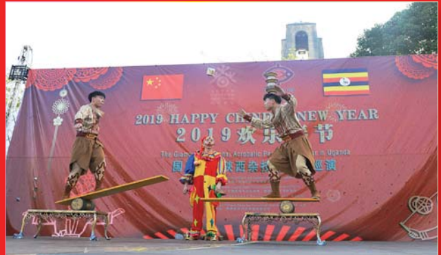
On January 26, 2019, Happy Chinese New Year Acrobatic Show was held at Makerere University.