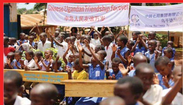
On April 25, 2018, students of the Kisubi Family Primary School in Kampala welcomed donations from a Chinese enterprise.