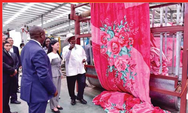
On March 9, 2019, President Yoweri Kaguta Museveni visited the Sino Textile Company and commended its efforts in Uganda