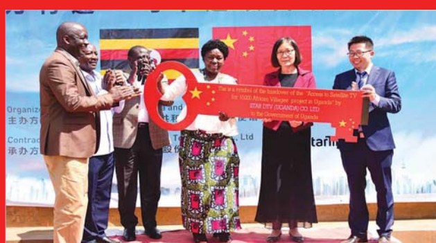
On January 14, 2019, Speaker of Ugandan Parliament Rebecca Alitwala Kadaga attended the handover ceremony of China-aid Access to Satellite TV for 10,000 African Villages Project in Kamuli District