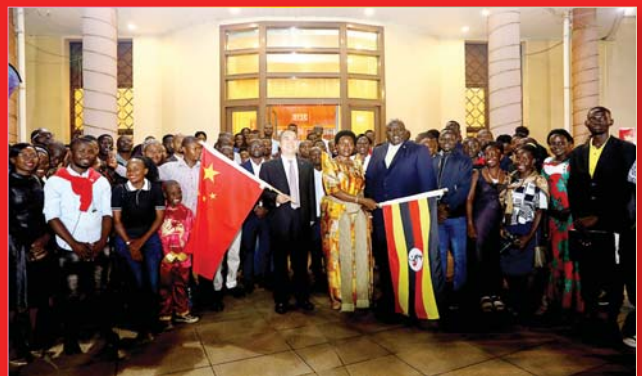
On August 27, 2019, 111 winners of the Chinese Government Scholarship of 2019 were flagged off at a reception held at the Chinese Embassy.