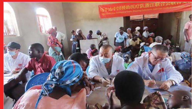
On March 15, 2019, China-aid Medical Team and Zhejiang Federation in Uganda carried out a joint free medical camp in the rural area of Uganda.