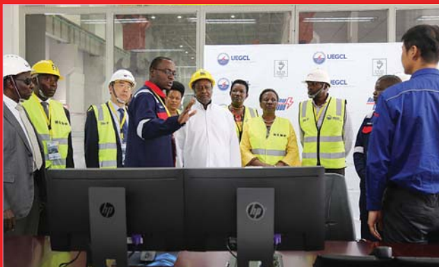
On March 21, 2019, President Yoweri Kaguta Museveni and Chinese Ambassador Zheng Zhuqiang commissioned the Isimba Hydropower Plant.