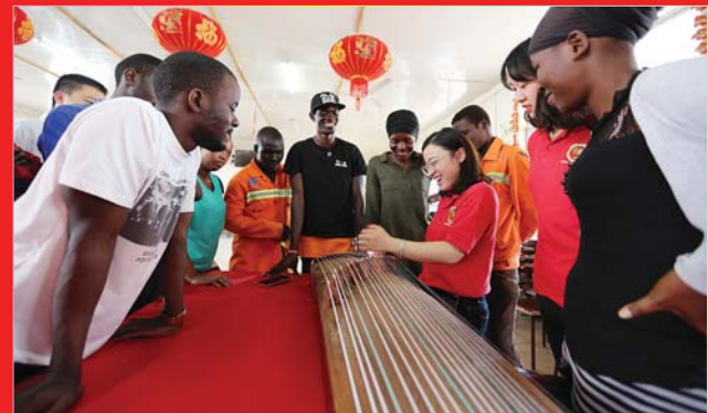
A teacher of Confucius Institute at Makerere University was showing Ugandan students how to play the zither, a Chinese traditional musical instrument.