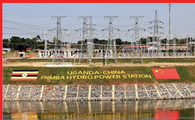
The Isimba Hydropower Plant is one of the symbols of China-Uganda cooperation