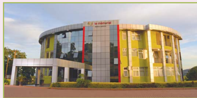
An over view of le Memorial Medical Services.