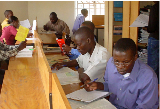
Students of Ndejje reading in the university library

We emphasise and support non-academic disciplines in this university. For instance, we have a comprehensive sports programme. Indeed, sports