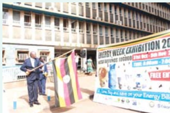
Figure 1: Energy Week 2016 in Pictures

WHEN: 11TH -16TH SEPTEMBER 2017, TIME: 8:00AM – 7:00PM