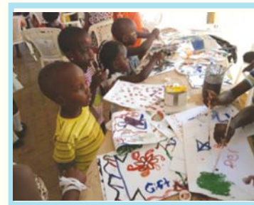
Some of the children participating in games at the Energy Week Family Day

The Family day will include; presentations about sustainable utilization of energy, a theme park (with bouncing castle, clowns, face painting) and energy competitions to educate and entertain school children. This event will be the climax of the Energy Week 2017 and will take place on Saturday 16th September 2017 .