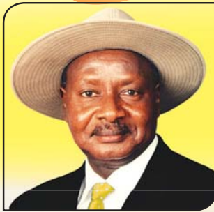
H E Gen. Yoweri Kaguta Museveni, President of the Republic of Uganda