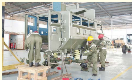
UPDF engineering brigade assembling motorised infantry fighting vehicles in Jinja. Being Assembled (R), Assembled (L).

Manifesto Commitment: Acquisition and maintenance of equipment.