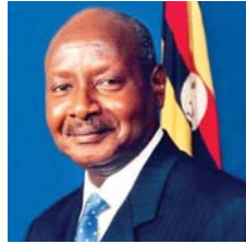
H.E. GEN YOWERI KAGUTA MUSEVENI President of the Republic of Uganda Commander-in-Chief of the UPDF

Uganda's strategic Defence posture is premised on having a strong PanAfrican UPDF that is able to preserve, defend and protect the sovereignty of Uganda, contribute to regional stability, and support international peace efforts.