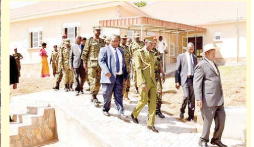
Bombo Intensive Care Unit and Senior Officers Ward