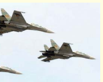
UPDF Su Khoi jet Fighters