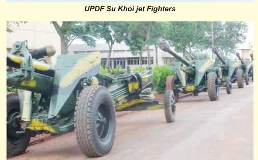
Force capability equipment