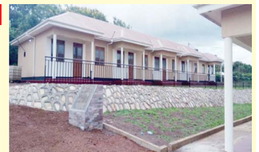
Special Forces Command (SFC) Entebbe Service Brigade accommodation.