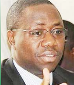
Hon Adolf Mwesige Minister of Defence and Veteran Affairs