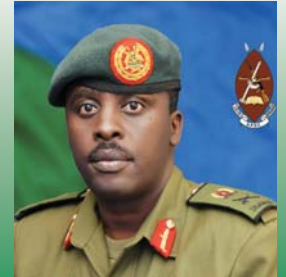
Gen David Muhoozi Chief of Defence Forces