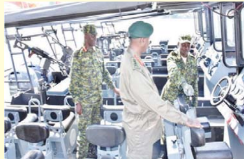
Acquired Force Capability Equipment