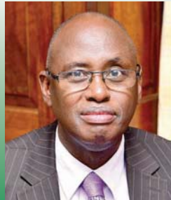
Hon Lt Col (Rtd) Dr. Bright Rwamirama: Minister of State for Defence - Veteran Affairs