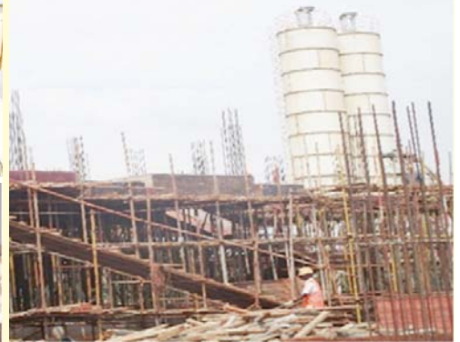
Military Referral Hospital-Lower Mbuya