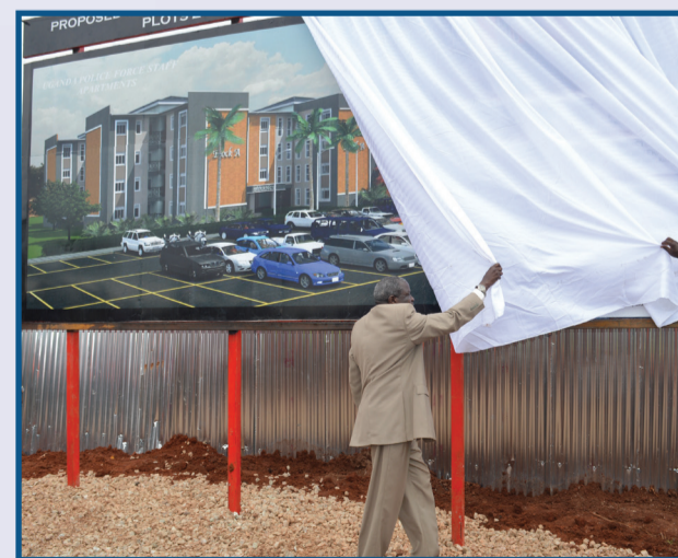
Hon. Minister of state for Internal Affairs Kania Obiga launching the construction of 1020 Housing Units for lower ranking officers

Long live the Uganda Police Force! Long live Uganda!