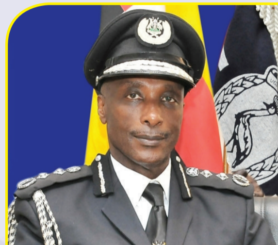
Gen. Kale Kayihura Inspector General of Police

The Inspector General of Police, Gen. Kale Kayihura, and the leadership of the Uganda Police Force wish His Excellency the President Gen. Kaguta Y. Museveni, cabinet members and all people of Uganda a jolly and peaceful Independence day.