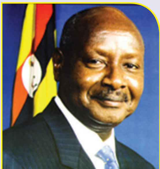
H.E. Gen. Kaguta Y. Museveni President of the Republic of Uganda