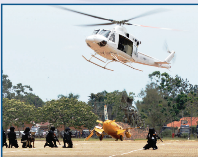
Counter Terrorism directorate exhibiting its aerial capabilities in combating terrorism during Police Day celebrations at Kololo