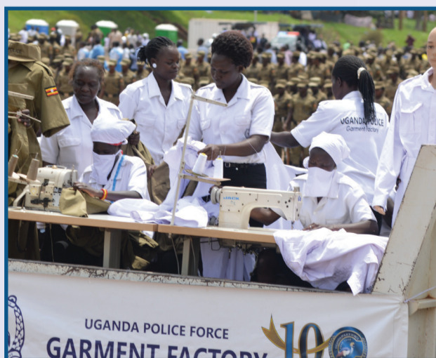
The Uganda Police Garments factory demonstrating their capabilities during Police Day celebrations at Kololo

Recently, the Hon. Minister of State for Internal Affairs Hon. Kania Obiga launched the construction of 1020 housing units at Naguru for lower ranking police officers during the police week celebrations geared towards improving on their accommodation.