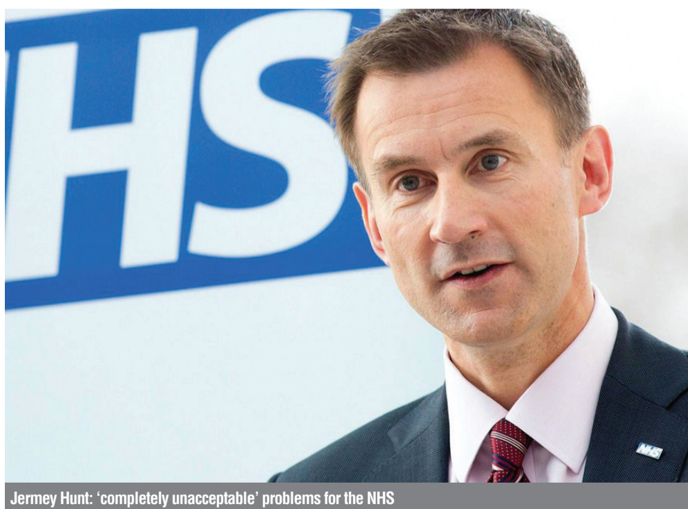
Jeremy Hunt: 'completely unacceptable' problems for the NHS

Lord Porter of Spalding, the Conservative chairman of the LGA, said: 'Extra council tax income will not bring in anywhere near enough money to alleviate the pressure on social care both now and in the future.'