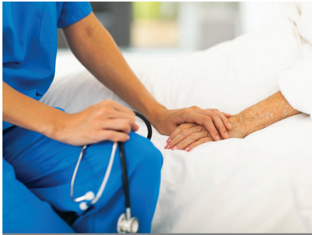
Many hospital beds are occupied by well patients who require support

'That means a typical 650-bed hospital may actually have only around 250 beds available for all its emergency patients, once you've taken out all the people who could go home if they had more support, and