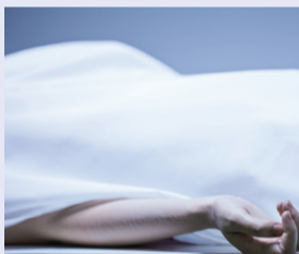
Unexpected deaths are on the rise in the UK

■ The number of unexpected patient deaths reported by England's mental health trusts has risen by almost 50% in three years, new figures suggest. The findings, reported in the BBC's Panorama programme, are based on Freedom of Information results from half of mental health trusts. Unexpected deaths include death by suicide, neglect and misadventure. The Department of Health has said the increase is to be 'expected' because of changes to the way deaths are recorded and investigated. Many NHS trusts have been dipping into their mental health services budgets to bolster other hospital services, according to recent reports.