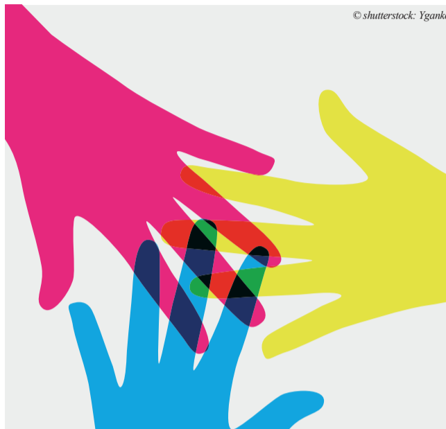
With increased demand predicted, councils may struggle to secure the required funds for many aspects of social care in the future, says IFS

The IFS says that given increasing demand and cost pressures from other sources faced by NHS providers, it seems likely that calls for further funding increases will continue. It forecasts that the non-NHS part of the Department of Health budget