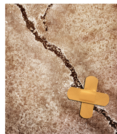
A report has raised concerns about the merging of the health and care sectors’ complaints procedures

The key themes found were delays in assessments, meaning that people have to wait longer to get the care they need, poor care or failure to provide services altogether, failure to deal with safeguarding issues and lack of appropriate aftercare following discharge from hospital for those sectioned under the Mental Health