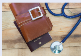
Healthcare providers can now be fined for missing cases of 'health tourism'

■ The Department of Health is considering new rules to enable commissioners to fine acute providers if they fail to check whether a patient is from overseas and eligible or not for free NHS care. It will also table secondary legislation in March to change the regulations affecting how trusts deal with 'health tourism'. Under the new regulations, which have yet to be published, trusts will be required to charge 'upfront and in full' overseas patients who are not entitled to free NHS care. Although trusts are able to do this currently, they are not required to do so by regulation.