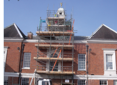
Land behind Braintree's town hall has been ear-marked for a housing project in the future

invested £1.8m in the project – but, more importantly, our residents will soon have a much more patient-friendly surgery, which we hope will attract new doctors.