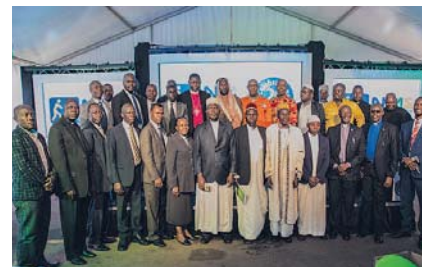
Religious leaders come together.