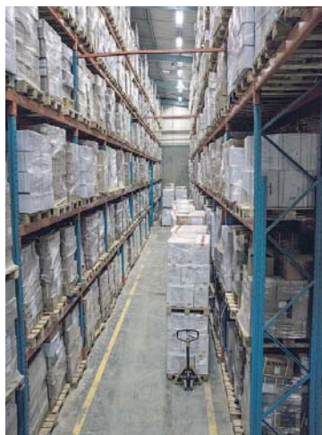
A section of the warehouse.