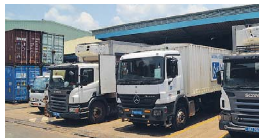
Trucks at the Despatch Point, getting loaded to deliver all over