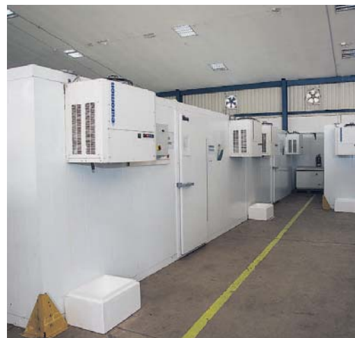
The NMS cold-rooms, which have an overall capacity of over 800