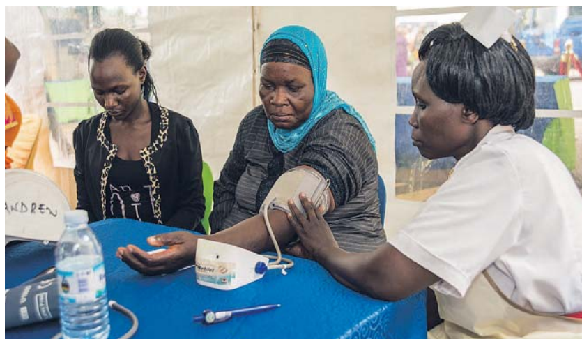
Checking blood pressure and other vitals in the Health Camp.