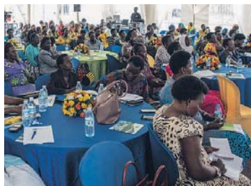
A section of the Women and Youth leaders in attendance.