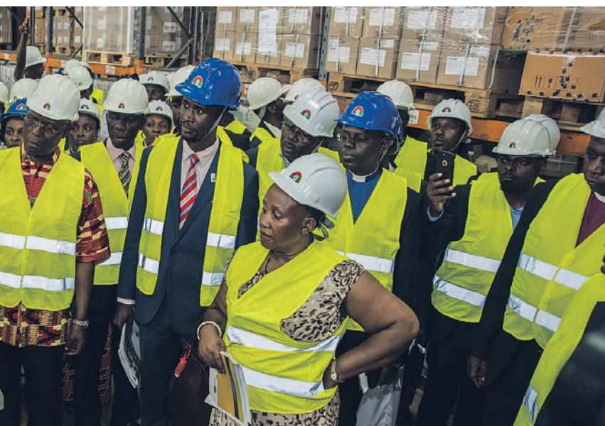
(orange jacket) makes an explanation to members of the religious fraternity during the warehouse tour.