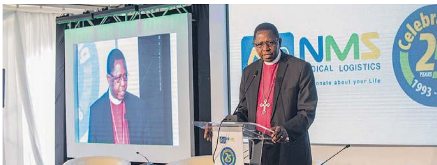
Archbishop Ntagali calls on all to stand against corruption in health facilities.

Activities included the guests being given a tour of the warehouse and cold-rooms, a health camp, and blood donation. Discussions chiefly centred on NMS' operations, and the various innovations that have seen the corporation set a number of benchmarks in medical logistics, including the global first of vaccine integration. Stakeholders were encouraged to play a role in improving health service delivery in Uganda, including promoting preventive health as a measure that can see the nation make overall gains in all sectors.