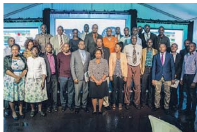
Members of the medical and pharmaceutical fraternity show their solidarity.