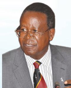
Hon Ephraim Kamuntu Minister of Water and Environment