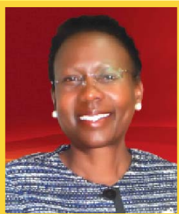
Hon. Dr. Jane Ruth Aceng Minister of Health