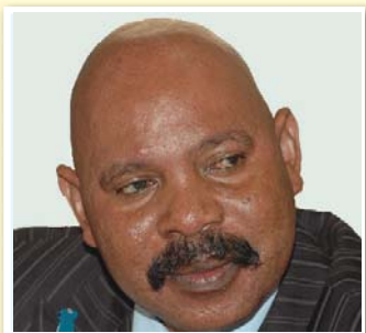
GENERAL JEJE ODONG Minister for Internal Affairs