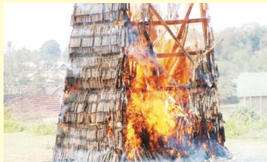
Destruction of fire arms