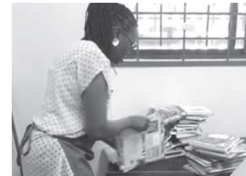
Kyambogo University Library Staff packing books for schools

Through this partnership, we work towards bridging the gap and supporting the curricula in several schools especially in rural Uganda. Several school going children have learnt to read and developed the desire to be better by reading BAI books distributed by Kyambogo University. We ensure that the little that is received trickles down to schools that express interest because certainly, the demand is far greater than what is received.