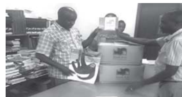
Kyambogo University Library staff handing over books to staff of St. Simon Peter Primary School, Kibaale.

As we join the rest of the World in Sharjah, UAE (the World Book Capital 2019) to celebrate the World Book and Copyright day 2019 under the theme, "Open