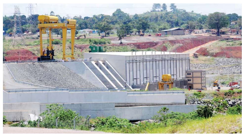
Bujagali hydro-power plant. The new hydro-power plants will add 33MW on the national grid

Currently, Uganda's installed generation capacity