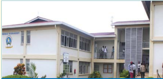
MOUNTAINS OF THE MOON UNIVERSITY - SAAKA CAMPUS

P.O. BOX 837 FORT PORTAL – Tel: +483 660 390, Email: info@mmu.ac.ug , registrar@mmu.ac.ug , , www.mmu.ac.ug , www.facebook.com/Mountains of the Moon University