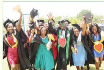
Students Jubilate at the recent Graduation Ceremony at SAAKA Campus