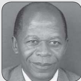
Hon. Dr. Muyingo John Chrysestom (MP) Minister of State for Higher Education