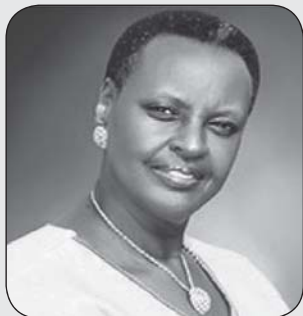
Hon. Janet K. Museveni Minister of Education & Sports