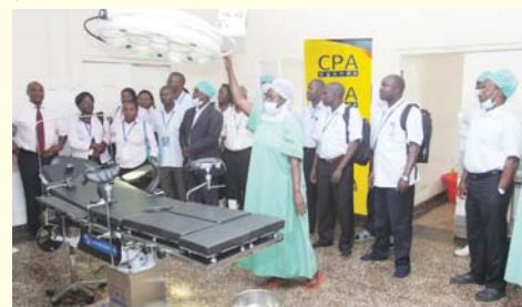
Donation of a theater bed and lamp to Entebbe Hospital

To realise this project, we need all the help we can from well-wishers, government inclusive.