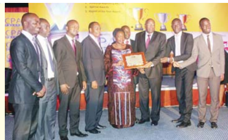
2015 ICPAU FiRe Awards Gold Winner- Stanbic Bank

We are looking at it as a positive sign and also deliberately encouraging female accountants to open their own accounting firms or aim for top jobs in order to attract others.