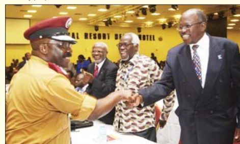
Three former ICPAU Presidents share a light moment with the Commissioner of Prisons during the Annual Seminar

As ICPAU continues to grow, it is becoming apparent that more space is needed for its activities as well as the need to find alternative sources of funding. For this, the Institute acquired 5 acres of land in Lubowa using internally generated funds and is mobilising funds to embark on a building project for its future offices.