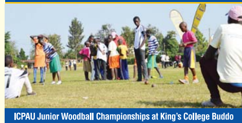
ICPAU Junior Woodball Championships at King's College Buddo

It should be noted that ICPAU is not indifferent to the needs of the wanaichi, and for this we have continued to participate in activities that project social responsiveness, such as tree planting, supporting hospitals and providing career guidance to students.