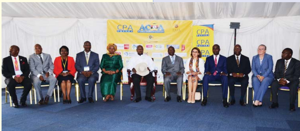
A group photograph with H.E. Yoweri Kaguta Museveni during the 4th Africa Congress of Accountants (ACOA) held in Kampala

Institute of Certified Public Accountants of Uganda (ICPAU)