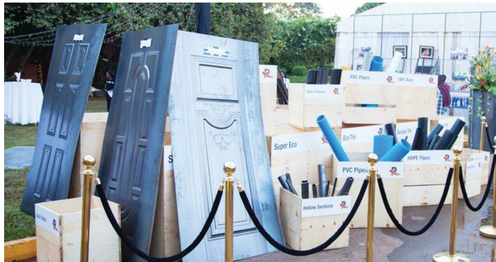
Some of the new products displayed during Roofings' celebrations to mark 25 years in business

our commitment to a culture of continuous improvement, through which we drive operational excellence in processes, products and people.