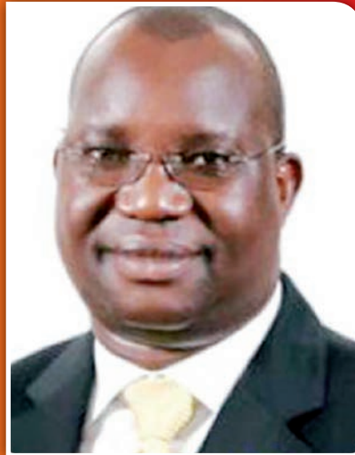
Hon. Rev. Fr. Simon Lokodo Minister of State for Ethics and Integrity

The Minister of State for Ethics and Integrity, the Permanent Secretary, Management and Staff of The Directorate for Ethics and Integrity, warmly congratulate His Excellency Gen. Yoweri Kaguta Museveni, the President of the Republic of Uganda, the Government of the Republic of Uganda and the general public on this auspicious occasion as we celebrate the 30 th NRM Anniversary.