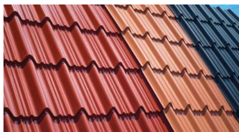
Versatile iron sheets