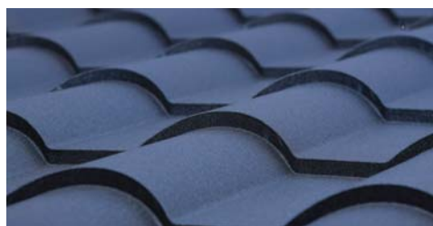
Ecotile iron sheets