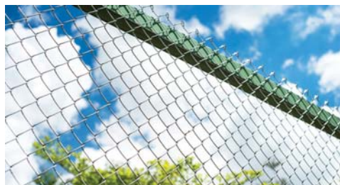
Chain link fence