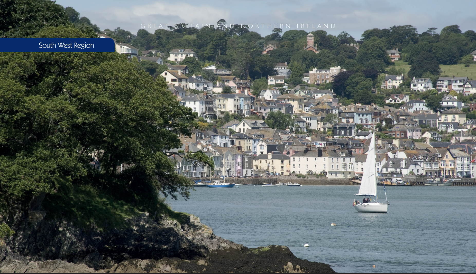
Dartmouth from the castle on the estuary of the river dart devon