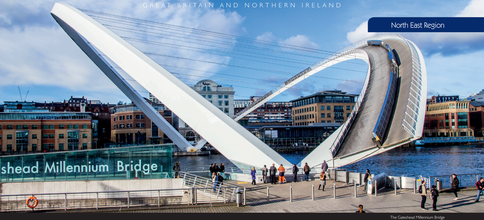
The Gateshead Millennium Bridge