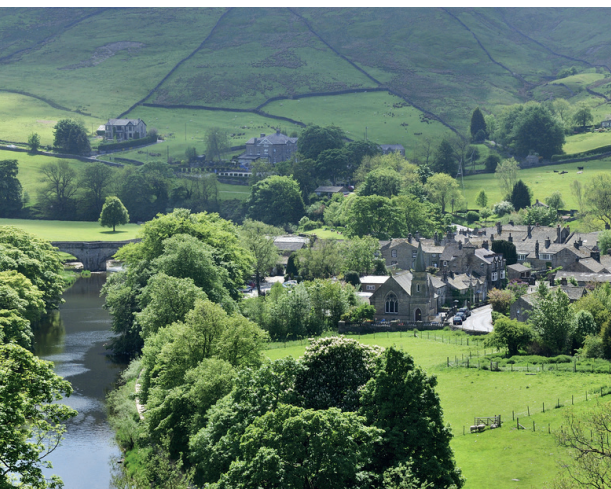
Burnsall Village, Yorkshire Dales National park

LEP boards are led by a business chair and board members are local leaders of industry (including SMEs), educational institutions and the public sector. In Yorks & Humber the LEPs are Humber, York, North Yorkshire and East Riding, Greater Lincolnshire and Leeds City Region. East Riding of Yorkshire Council is a member of two Local Enterprise Partnerships; the Humber LEP and York, North Yorkshire & East Riding LEP. The government has announced that LEP overlaps will end. ●