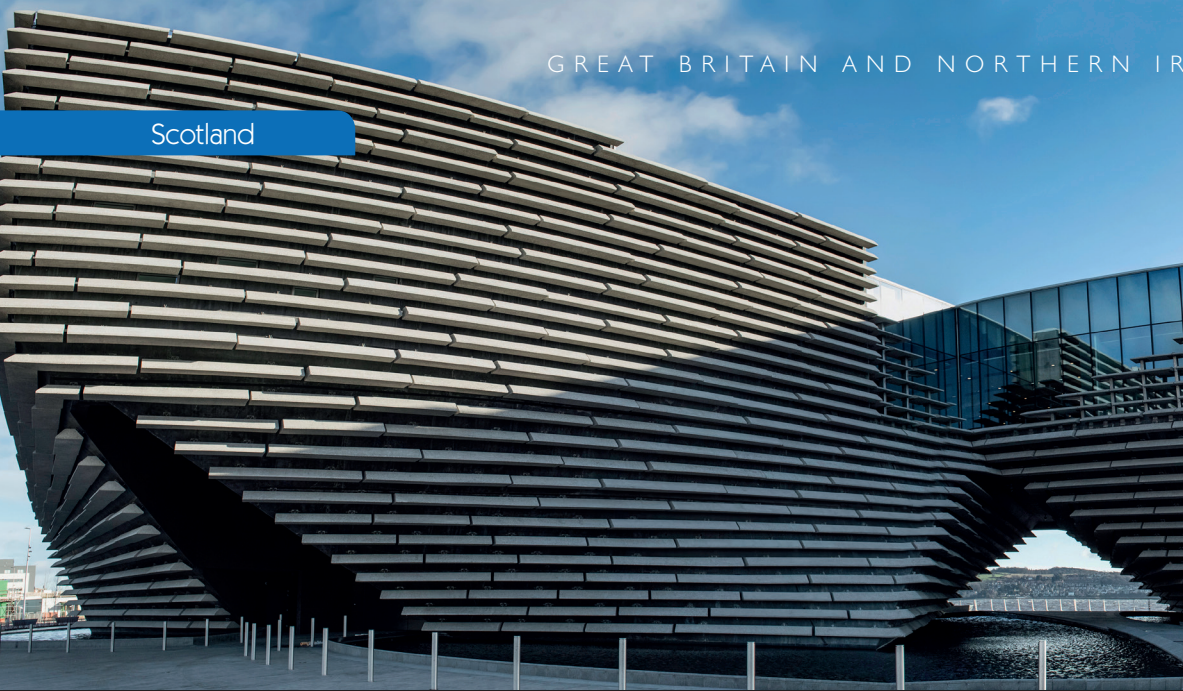
V&amp;A Museum of Design, Dundee in Scotland