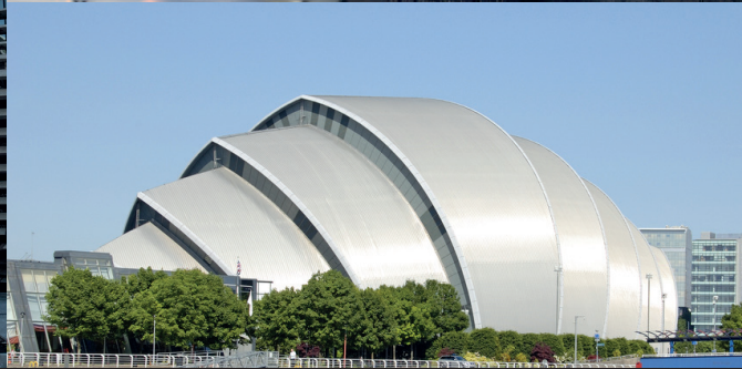
The Armadillo concert hall on the bank of the River Clyde in Glasgow, Scotland