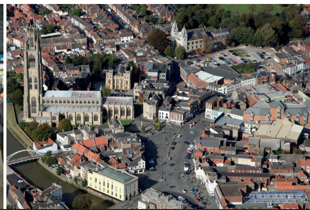
Boston town centre, Lincolnshire