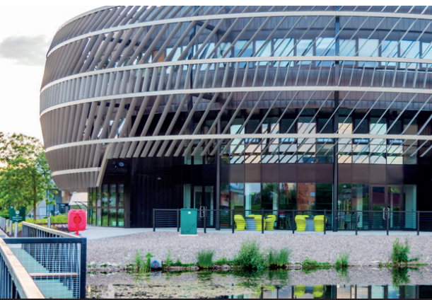
Jubilee Campus, Nottingham University