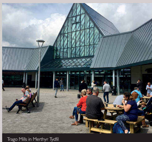
Trago Mills in Merthyr Tydfil

The decline of heavy industry in Wales from the 1970s onwards left a legacy that's been hard to shake off but the country's economy – worth £60bn a year – is on the up and the focus is very much on its areas of strength. For example, it has eight enterprise zones