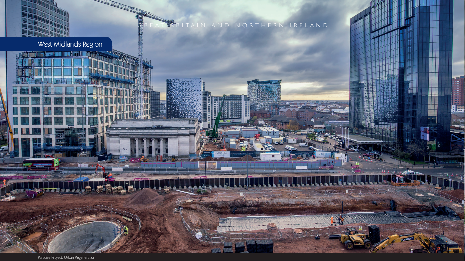
Paradise Project, Urban Regeneration