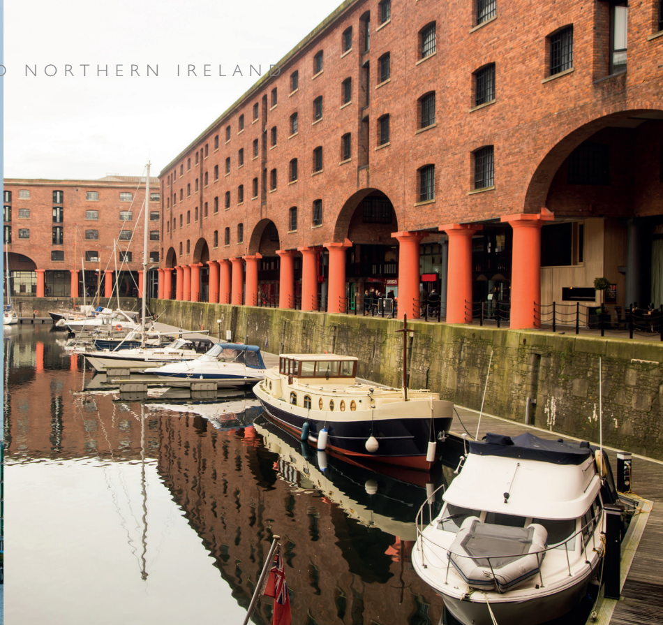
Albert Dock, a renovated Victorian dockland area