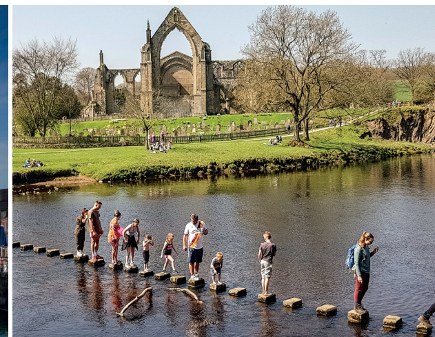
Bolton Abbey Yorkshire Dales