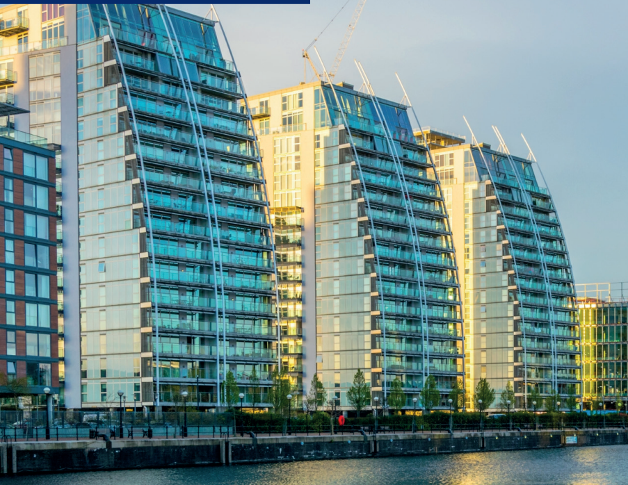
Salford area of Manchester with residential buildings surrounding a basin on river inwell