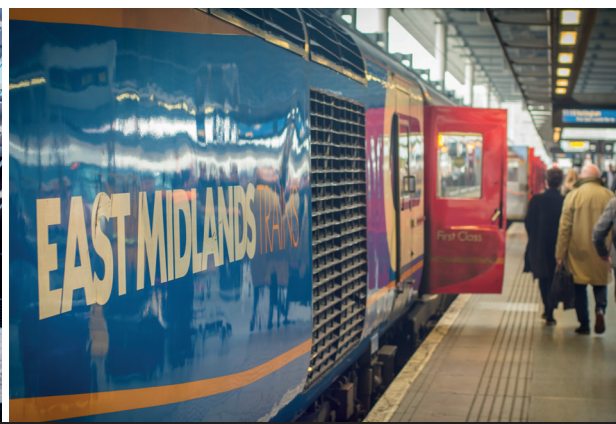
East Midland Train