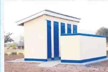
Newly completed lined VIP girls toilet at Paloga Primary School expected to serve 200 pupils.

WSDF-N will design and develop water supply systems in Palabek Kal, Lamwo TC, Arra/Dufile TC, Kati, Parabong, Obongi, Patiko, Lacekocot, Alangi, Abia, Olilim, Bari-Jobi, Cwero, Zeu, Apala, Palenga, Ovision, Awach, Barakala, Koch Goma, Bobi, Alere, Alo, Bangala, Aromo, Alero and all other upcoming Rural Growth Centres.