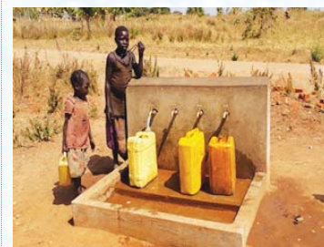
Children fetching water at a Public Stand Post in Namokora in Kitgum District.

Water and Sanitation Development Facility – North Plot No 14/16 Maruzi Road P.O.Box 381 Lira Tel: +256 392 705 946 Email: wsdn@mwe.go.ug