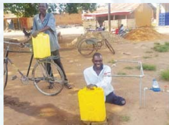
Consumers collecting water from one of the public stand tap in Patongo Town Council.