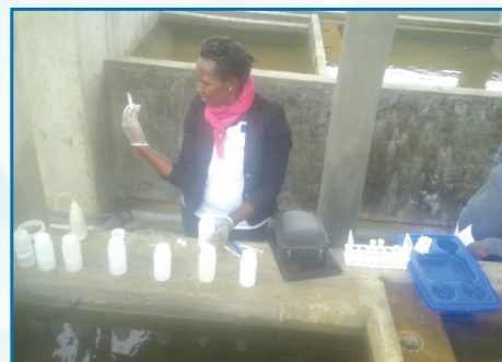
An official carrying out water quality test

delivery and disposal of water and others in water related sectors that directly or indirectly depend on water. The theme - “Water and Jobs” - shows how enough quantity and quality of water can change workers’ lives and livelihoods, and even transform societies and economies. This provides an important opportunity to