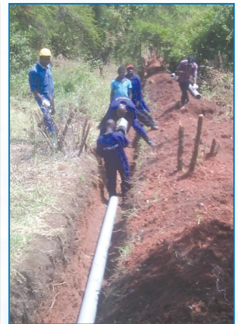
Workers laying pipes for a water supply system

The water sector requires and directly employs different professions with skills and knowledge in engineering, social works / sociology, sanitation, public health, development studies, surveying,