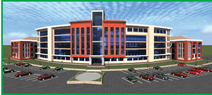
Impression view of the multipurpose Academic, Teaching and Laboratory Block

THE TASK FORCE OF SOROTI UNIVERSITY CONGRATULATES HIS EXCELLENCY THE PRESIDENT OF THE REPUBLIC OF UGANDA, GEN. YOWERI KAGUTA MUSEVENI, THE GOVERNMENT AND ALL UGANDANS ON THE 30TH NRM ANNIVERSARY. WE COMMEND GOVERNMENT FOR CONTINUOUSLY SUPPORTING THE PROJECT, WE PLEDGE OUR COMMITMENT AND READINESS TO WORK DILIGENTLY FOR THE SUCCESS OF THE UNIVERSITY. FOR GOD AND OUR COUNTRY.