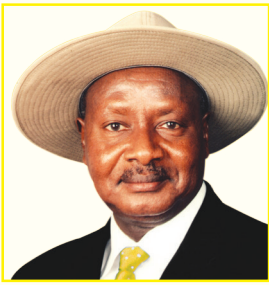
HE. Yoweri Kaguta Museveni President of the Republic of Uganda