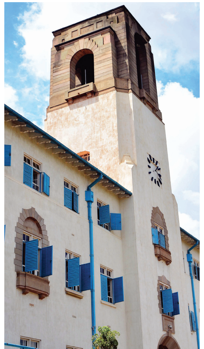
The Makerere University main building

I agree with the students' observation on premises. What I can say is that we have challenges in providing adequate room and sufficient facilities for lectures and other infrastructure. However, we are doing something about this. For instance, we are coming up with two new buildings near the faculty of social sciences.