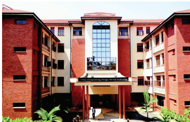
The college of engineering, design, art and technology

However, the students' view on some aspects of welfare is fair. For instance, feeding has improved at the university. However, we have yet to address some key issues. Yes, the situation in the halls of