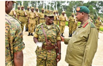
Commander-in-Chief talks to a Female Commander at the Uganda Military Academy

The Ministry of Defence purchased the defunct Lugazi University premises and allotted a section of the facility to Uganda Military Engineering College (UMEC) in October 2010. UMEC was established to progressively develop engineering, technology and any other scientific capabilities in the UPDF. The research and development section of UMEC has made a number of successful projects like making of concrete railway slippers that can enable a train attain a speed of 250km/hr and axle load of 25tonnes, Unmanned Aerial Vehicle (UAV) that has flown to a satisfactory level of success, modification of Maize Haulers and Grinding. UMEC has also made a 25KW Wind Power Turbine now used to generate electricity to pump 24,000 liters of safe water daily and to power computer laboratory with other sections of UMEC. Ministry of Defence, through its National Enterprise Corporation has