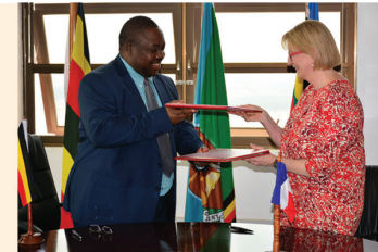
Hon. Adolf Mwesige, Minister for Defence and H. E. Mrs. Sophie Makame, The French Ambassador to Uganda exchange documents after signing MoU on Defence Cooperations

The UPDF's rapid response and timely arrest of the fast deteriorating security situation in South Sudan in 2013 and the, twice, successful rescue of Ugandans trapped in the youngest Nation is one of the indicators of professionalism of the Force and its dedicated contribution to regional peace and stability. The UPDF is now part of a bigger family of both Eastern Africa Standby Force (EASF) and the African Union which have a joint capacity building