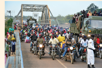
South Sudan Rescue: Ugandans and Sudanese crossing Nimule border in secure hands of the Uganda Peoples Defence Forces

mechanism for maintaining peace and security on the African Continent. Uganda continues to promote defence diplomacy which has contributed to a healthy strategic relationship with several countries around the world.