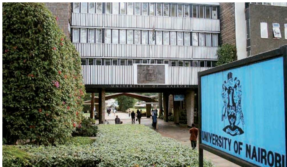
University of Nairobi has various campuses across Kenya and is home to many students in the region