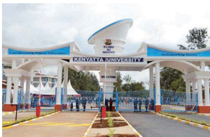
Kenyatta University welcomes students from Uganda

Institute of Certified Public Accountants of Uganda Plot 42 Bukoto Street, Kololo, P.O. Box 12464, Kampala, Tel: 0414 - 540125, 0393 - 262333 / 0393 - 265590. Email: students@icpau.co.ug . Website: www.icpau.co.ug