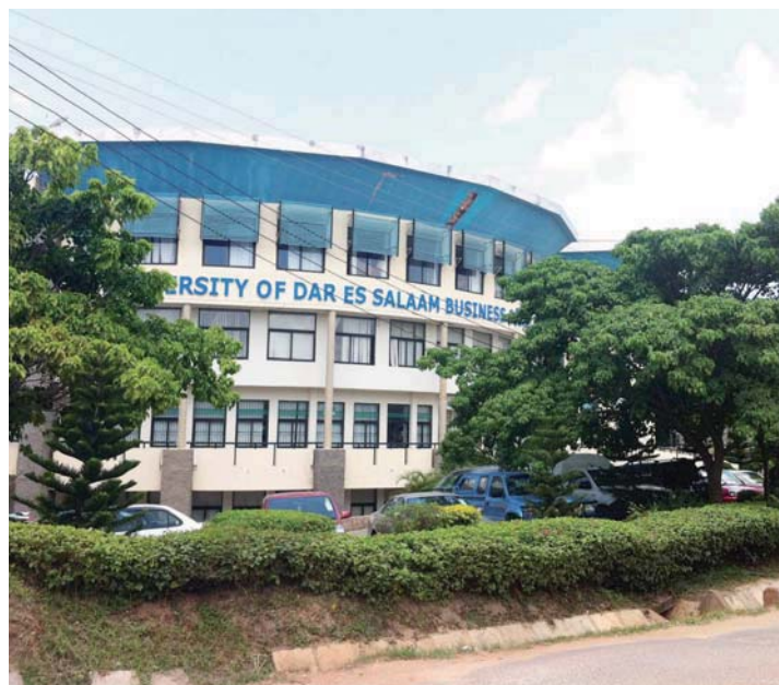
The University of Dar es Salaam in Tanzania accepts the conversion of high diplomas

School of Finance and Banking Tel : (250) 55111794