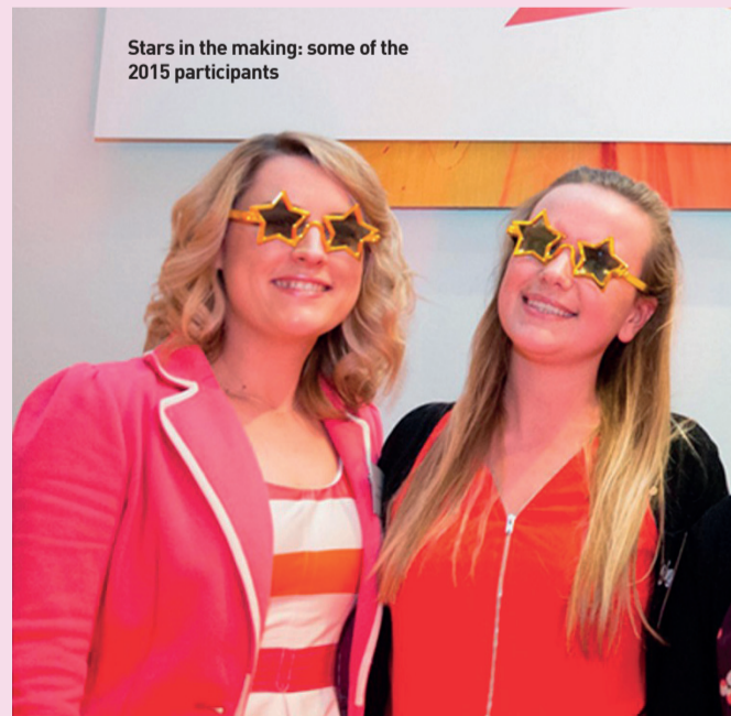
Stars in the making: some of the 2015 participants

It has been a privilege to work with our key sponsor Manpower Group who have been so very generous with their time and expertise coaching and nurturing the talent that we have worked with. It has also