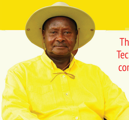
H.E. GEN. YOWERI KAGUTA MUSEVENI, PRESIDENT OF THE REPUBLIC OF UGANDA

Our services: Civil Engineering, Road Construction and Maintenance, Water Supply & Sewage Systems, Solar Installation.