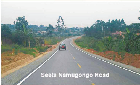
Seeta Namugongo Road

We strongly commit to continue providing reliable & high quality products at the right time and at the right cost.