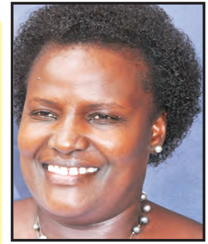
MINISTER OF INTERNAL AFFAIRS HON. ROSE AKOL OKULLO

The Hon. Minister of Internal Affairs, Hon. Rose Akol Okullo, the Minister of State for Internal Affairs Hon. Amb. James Baba, Permanent Secretary, Chairperson National Citizenship and Immigration Control Board (NCICB) and the staff join Ugandans in commemorating the 30th National Liberation celebrations on 26th January 2016