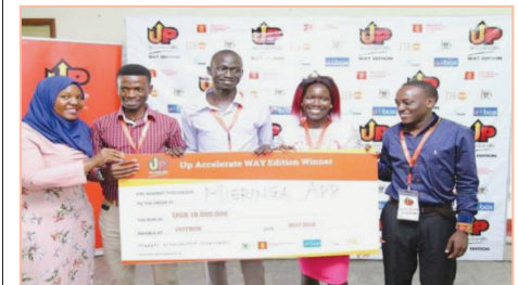
Achievement: Students of Bachelor of Science in Information Technology emerged Winners of UGX: 18 Million in Seed funding & mentorship under the UP Accelerate WAY Edition, 2018.