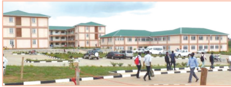
Infrastructure: A section of Muni University Campus [Faculty of Technoscience Lecture Block]

Muni University is the Sixth Government University established by Statutory Instrument 2013 No. 31. The University is located at Muni Hill, in Arua District, West Nile Region , approximately 3.5Km south of Arua Town. The University vision is "A model University of transformation and development".