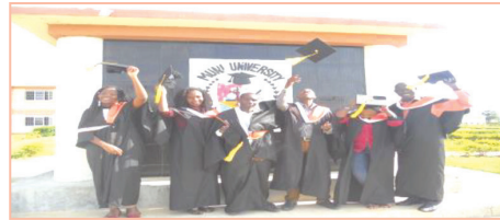
Output: Graduates celebrating the Academic Achievement, during the 2nd Graduation Ceremony [held 3rd November 2018].