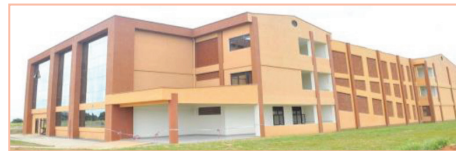
Teaching Facilities: The Multi-purpose Health Sciences Laboratory (with support from ADB).

The main campus boasts of a quiet and tranquil campus environment conducive for learning. Muni University uses Blended Learning approach; where face-to-face interaction is combined with online learning. Students enjoy unlimited Wi-Fi internet connectivity in and around campus, and use of Kindle Readers to access library e-resources.