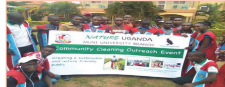
Outreach: Nature Uganda (Muni University Branch) on a "Community Cleaning Event" in Arua District.

The Office of Dean of Students oversees and takes special interest all students' affairs; including Students Guild, Spiritual welfare, Guidance and Counseling, Games and Sports, and Accommodation.