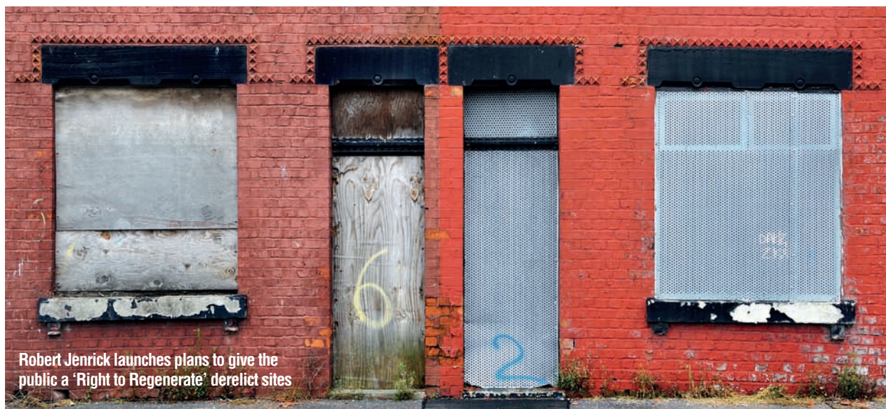
Robert Jenrick launches plans to give the public a 'Right to Regenerate' derelict sites