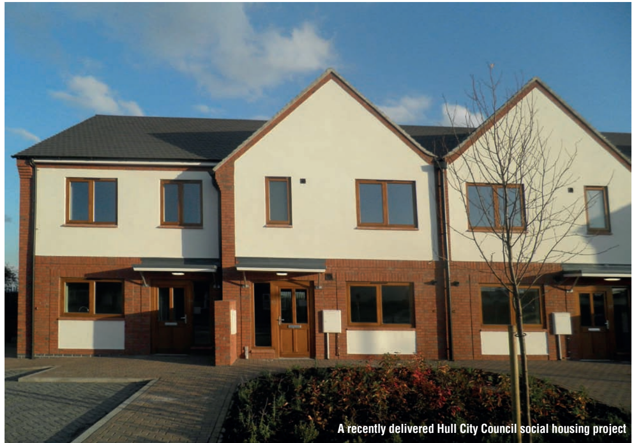
A recently delivered Hull City Council social housing project

and make the housing service more efficient, Hull launched a programme to slow over turnover of properties, to stabilise the rate of evictions and cut arrears.