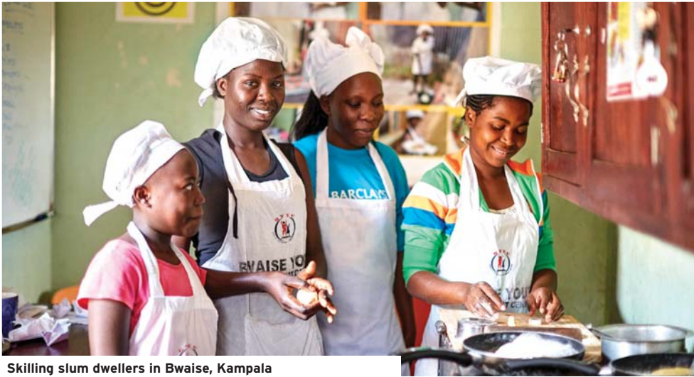
Skilling slum dwellers in Bwaise, Kampala