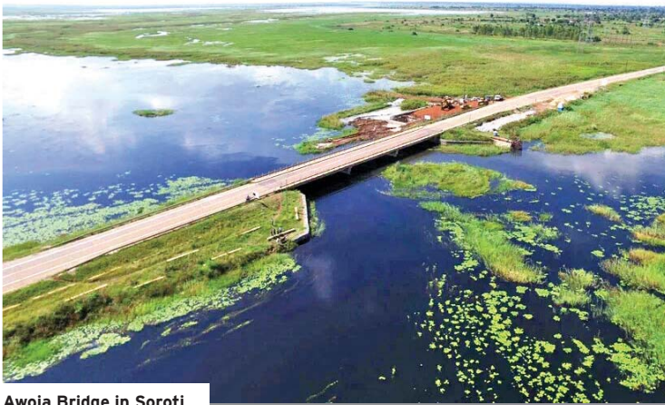
Awoja Bridge in Soroti