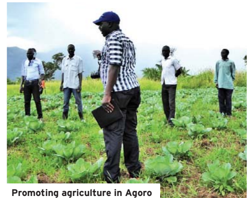
Promoting agriculture in Agoro