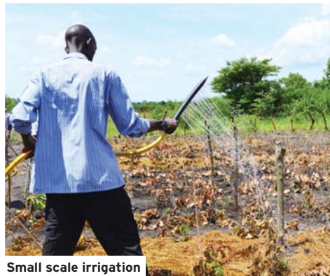
Small scale irrigation