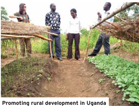
Promoting rural development in Uganda