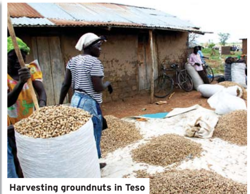
Harvesting groundnuts in Teso