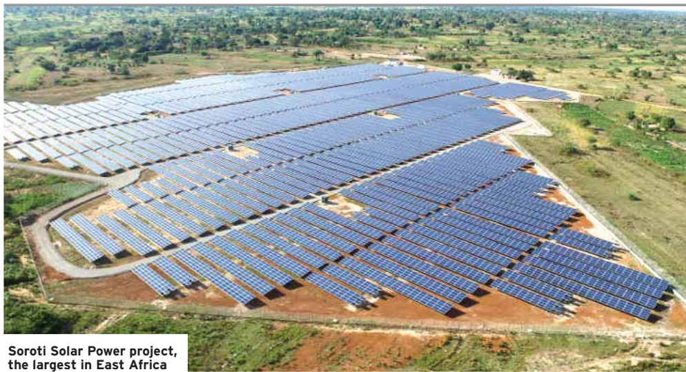
Soroti Solar Power project, the largest in East Africa