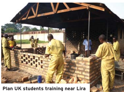
Plan UK students training near Lira