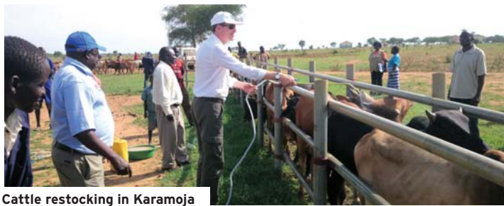
Cattle restocking in Karamoja