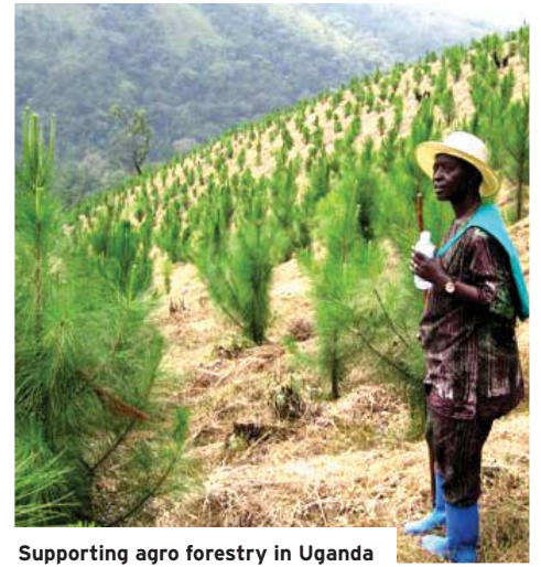
Supporting agro forestry in Uganda