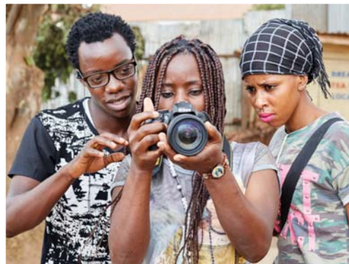
Inequalities social cohesion in Bwaise slum, Kampala