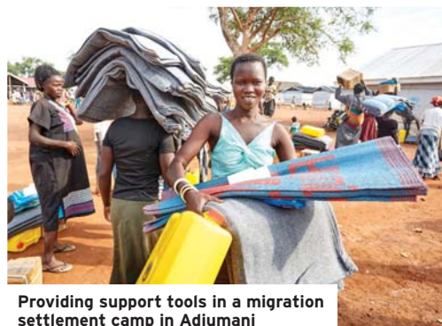
Providing support tools in a migration settlement camp in Adjumani