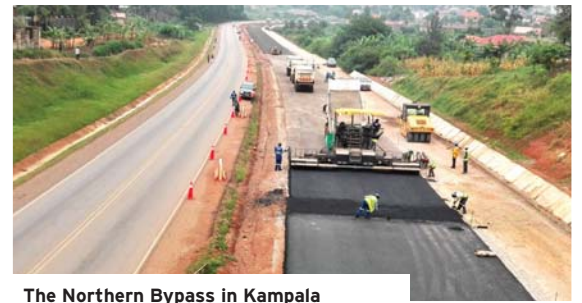
The Northern Bypass in Kampala

The European Union has over the years supported Uganda in financing a large number of projects, including infrastructure agriculture and rural development, among others. Below is a pictorial of some of the programmes the EU has been funding