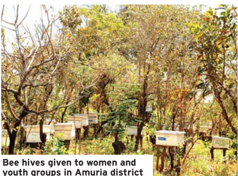
Bee hives given to women and youth groups in Amuria district