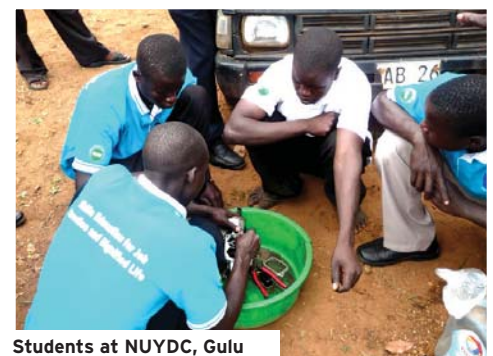
Students at NUYDC, Gulu