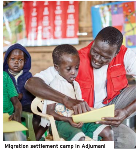
Migration settlement camp in Adjumani