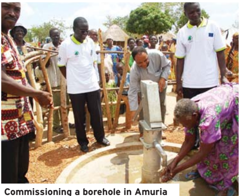
Commissioning a borehole in Amuria