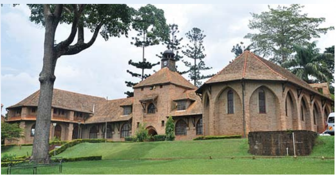
Bishop Turker Building at Uganda Christian University