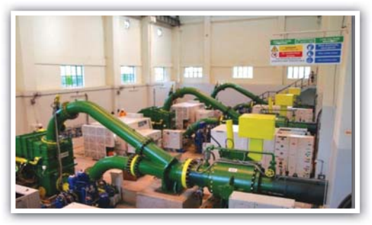
Kabalega Hydro Power plant (9MW) - Hoima District Status : In operation