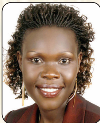
Hon. Anite Evelyn Minister of State for Youth and childrens affairs