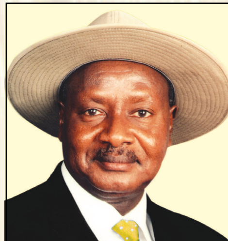
HE Yoweri Kaguta Museveni President of the Republic of Uganda

Our Mission: Is to promote gender equality, social protection and transformation of communities