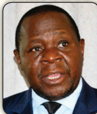
Hon. Sulaiman Madada Minister of State for Disability and Elderly Affairs