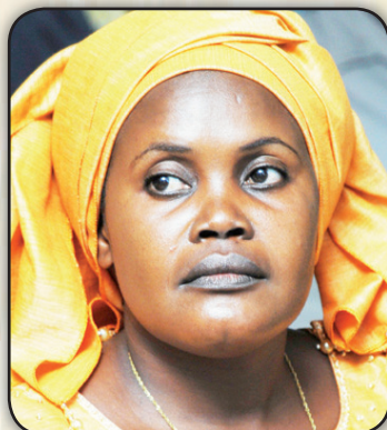
Hon. Lukia Isanga Nakadema Minister of State for Gender, women and Culture affairs