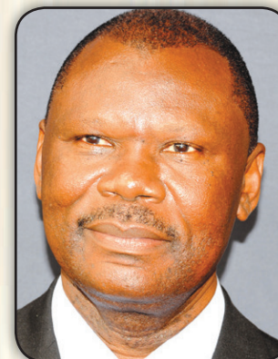
Hon. Dr. Kamanda Bataringaya State Minister for Labour, Employment & Industrial relations