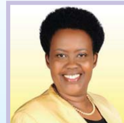
HON. JOY KABATSI State Minister for Animal Industry