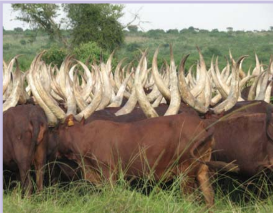
Conservation of the Ankole long horned at Nshaara Ranch