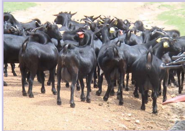
Conservation and Breeding for Mubende goats at Sanga Field Station

The National Animal Genetic Resources and Data Bank is mandated to carry out comprehensive breeding programme in Uganda. NAGRC&DB has strategized to realize these goals through: (i) enhanced animal genetic improvement efforts for increased animal production and productivity (ii) Conservation biodiversity, sustainable utilization and development of indigenous animal genetic resources (iii) Strengthen institutional management capacity, growth and development (iv) Client oriented services, collaboration and entrepreneurship (v) National animal information resource and development centre established.