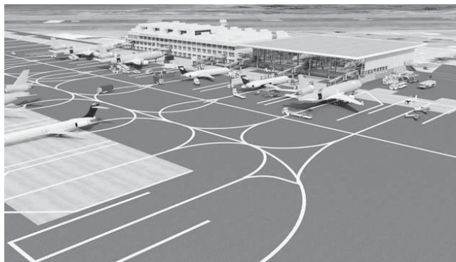
Artistic impression of the Aircraft Parking Apron on completion

We commit our Labour to the transformation of Uganda's air transport industry through attraction of air operators to Uganda's airspace and upgrade of Entebbe International Airport to enhance the user experience and competitiveness for national development.