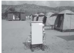
Camp Design and installation for Tullow Oil Pty Ltd