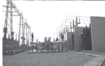
Jacobsen International. Electrical installation of a 50MW heavy fuel oil-fired thermal power plant at Namanve Power station