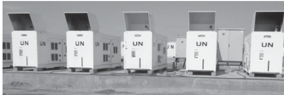
Terrain Services Ltd- JGSDF camp in Juba, Southern Sudan. Design, supply, Installation and commissioning for Low Voltage Reticulation, Cabling and switch gear