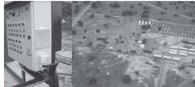
Camp Design and installation for Equator Catering