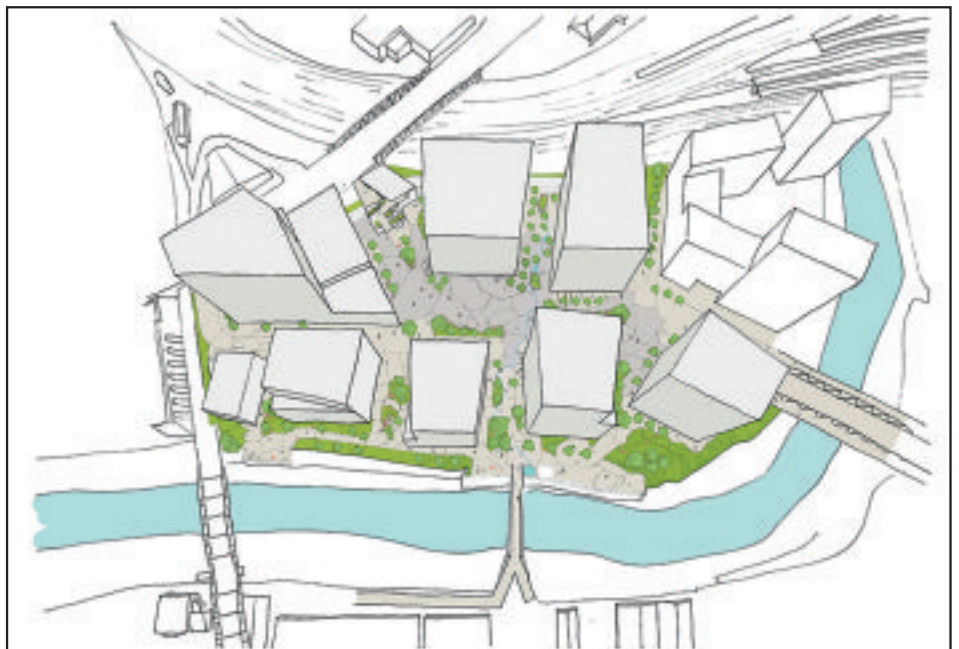
Legal & General's proposals for the mixed use regeneration of Temple Island, part of the wider Temple Quarter development which is in progress ( above )

And of course, austerity means that affordable housing