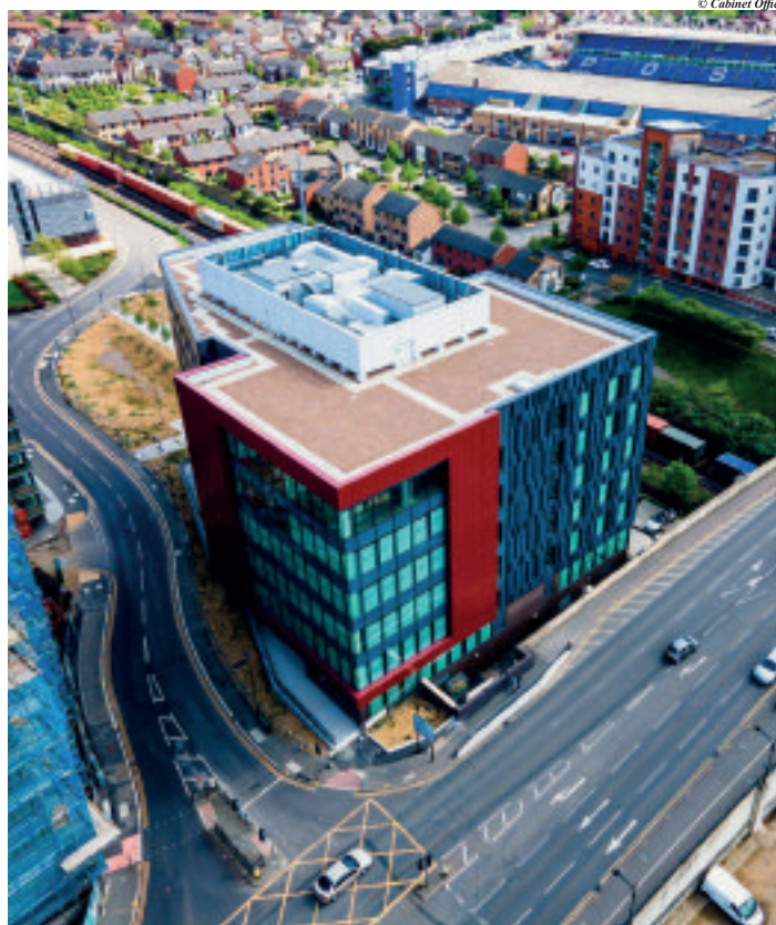
Quay House, Peterborough – one of the new government hubs

We have found that early conversations with local leaders are vital to help pinpoint investment in the right places. Local teams have unparalleled insight into the specific challenges and opportunities in an area, and by understanding their priorities we have been able to ensure that our work is as mutually beneficial as possible.