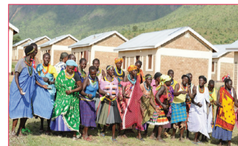
Residents of Kampswahili welcome the Nakaperimen Hydraform Houses

Over 40 Model low cost Hydra form houses were constructed for the elderly and vulnerable people of Nadunget, Nakapelimen, Acerer and Lorengedwat.