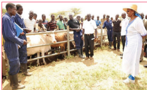
Community livestock workers under the dry Lands Integrated Development Projects demonstrate to the outgoing Minister for Karamoja the skills they impart to communities to ensure good health of their animals.