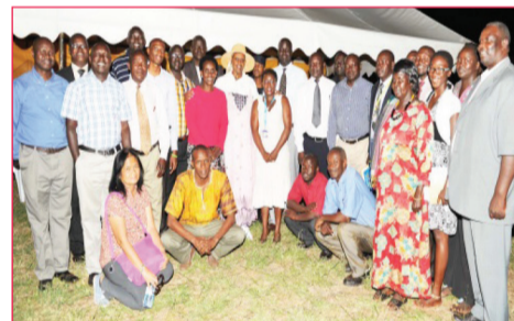
Outgoing Minister for Karamoja Affairs, Mrs. Janet Museveni with development partners and health officials during the launch of in the Karamoja immunization campaign

Karamoja Region Immunisation Strengthening Campaign was launched by the Minister for Karamoja with the aim of ensuring that all children under 1 year are immunized against the nine vaccine-preventable diseases by November 2015. The campaign also invested in providing for supplemental services like family health days, outreach services to hard to reach areas, and strengthening of the VHTs role in mobilization of the communities.