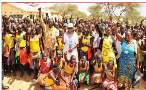
Outgoing Minister for Karamoja Hon. Janet Museveni with the team leaders of the Dry Land Integrated Project in Karamoja.

The Dry Land Integrated Project which aims at strengthening the livelihood and reducing vulnerability of pastoralist and agro-pastoral communities in Karamoja is implemented in four sub counties of Nadunget in Moroto, Lotome in Napak, Lorengedwat in Nakapiripirit and Loro in Amudat district. It has supported farmers with improved agricultural inputs and fruit seedlings and households have been supported to excavate pit latrines. Secondary school scholarships have been provided to some students, while some Primary teachers have undergone training and some SACCOS registered and provided with seed capital.