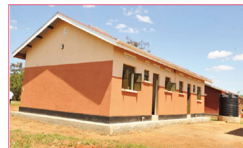
A teachers house constructed under NUSAF 2 at Lolachat Primary School in Nakapiripirit District