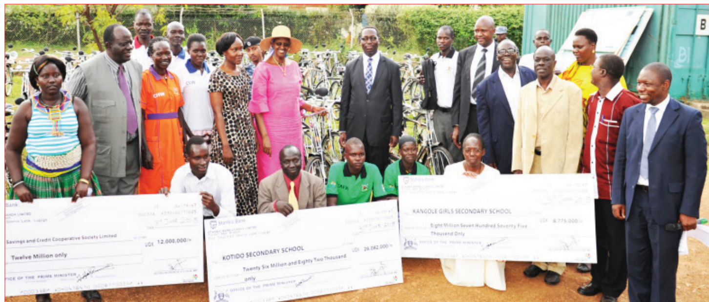
First Lady and outgoing Minister for Karamoja Affairs Janet Museveni and officials from the Office of the Prime Minister, the Dry Land Integrated Development Project Officials during the launch of the project in Moroto

With a Grant from the Government of Italy and Co-financing from the Government of Uganda 34 Staff Houses have been constructed at selected Public and Private-Not-For-Profit Health Centres in Kaabong ( 3 Units), Kotido (8 Units), Abim ( 5 Units), Moroto ( 3 Units), Napak ( 7 Units) , Amudat ( 4 Units) and Nakapiripirit( 4 Units) enabling the hospitals to accommodate their staff.