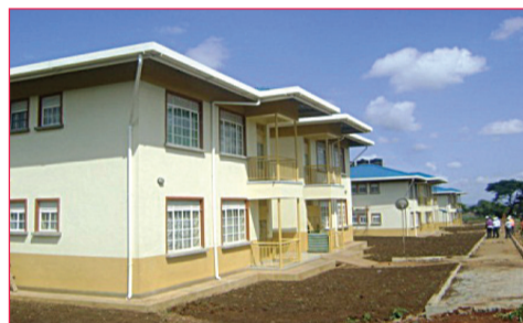
6 staff units at Moroto Regional Referral Hospital

With a Grant from the Government of Italy and Co-financing from the Government of Uganda 34 Staff Houses have been constructed at selected Public and Private-Not-For-Profit Health Centres in Kaabong ( 3 Units), Kotido (8 Units), Abim ( 5 Units), Moroto ( 3 Units), Napak ( 7 Units) , Amudat ( 4 Units) and Nakapiripirit( 4 Units) enabling the hospitals to accommodate their staff.