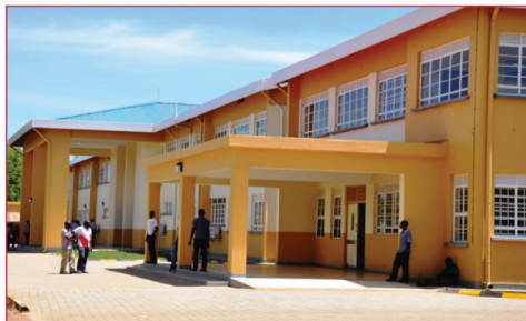
The completed Shs.25 billion building at Moroto Regional Referral Hospital

Government constructed a Shs.25b building at Moroto Regional Referral Hospital with 10 departments, including an outpatient section, emergency wards for casualties and recovery wards to accommodate more than 500 patients. Two boreholes have also been drilled (one of them solar powered and one connected to the national electricity grid) to help supply water to the hospital.