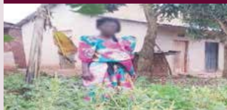
OVC guardian in a backyard garden of greens vegetable (dodo) in Nangabo sub county in Wakiso district