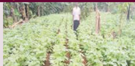
OVC guardian in a backyard garden of beans in Wakiso sub county in Wakiso district