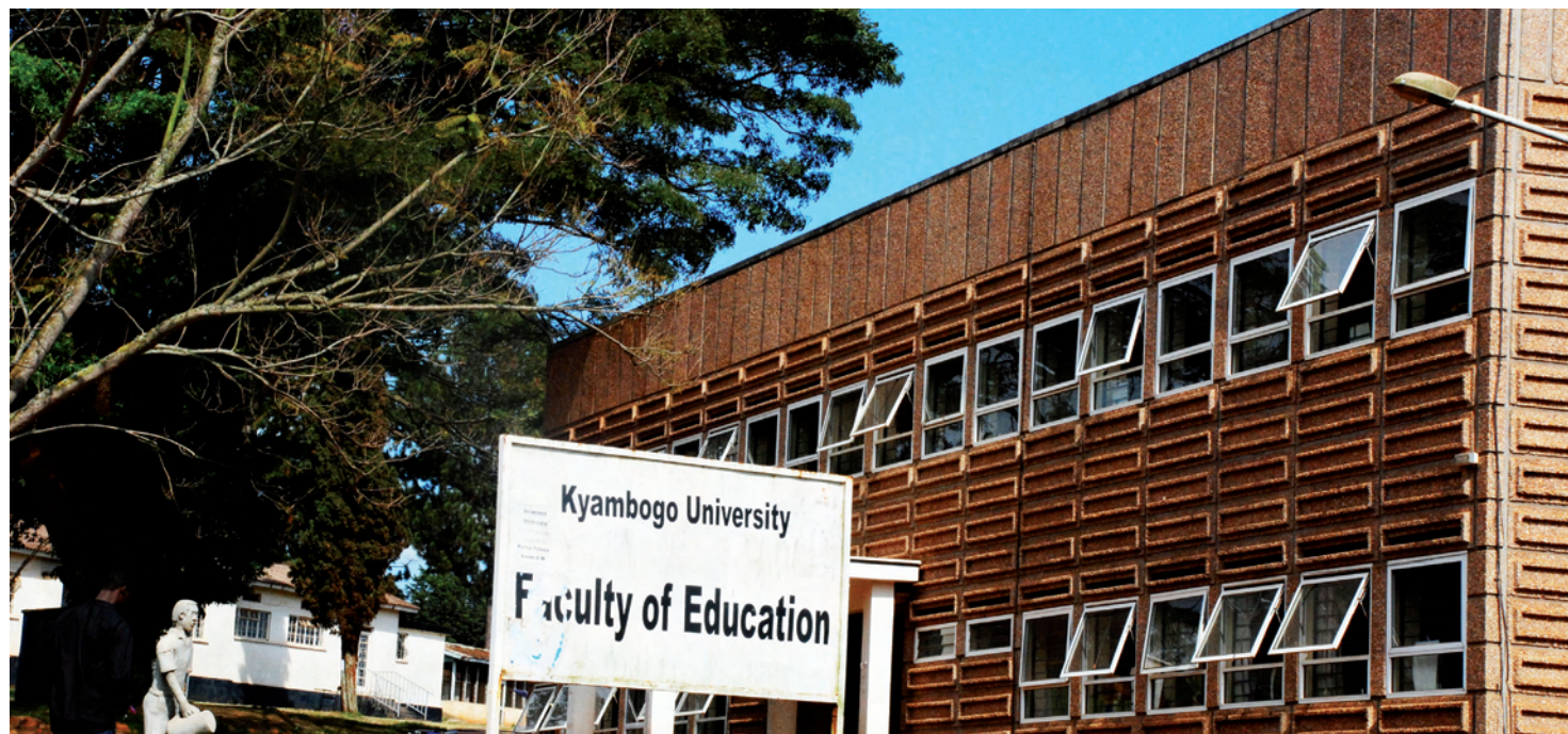
The Faculty of education at Kyambogo university. The Institution is famous for teacher training

However, respondents said they felt unsatisfied with the university premises, studying arrangements, student welfare and learning resources. Why is the university not doing well on the above?